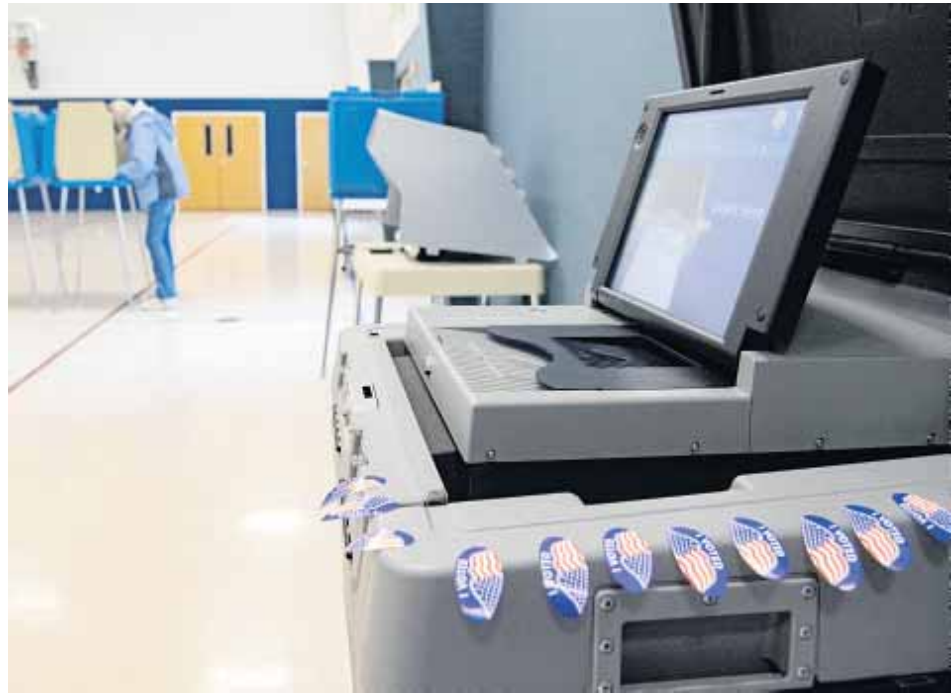
College Township residents vote at the Mount Nittany United Methodist Church on Tuesday, Nov. 2, 2021.

A: The right to vote is the foundation of our democracy. It is imperative that we make it easier — not harder — for every eligible citizen to