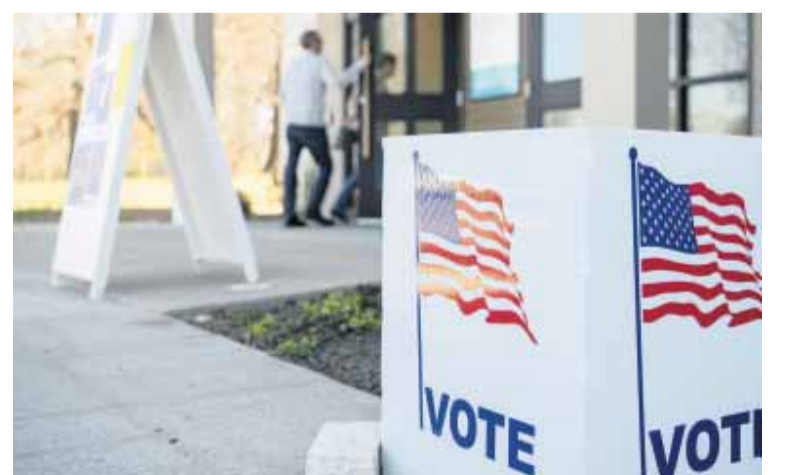
Voters enter the Oakwood Presbyterian Church for the Patton South 2 precinct on Tuesday, Nov. 8, 2022.