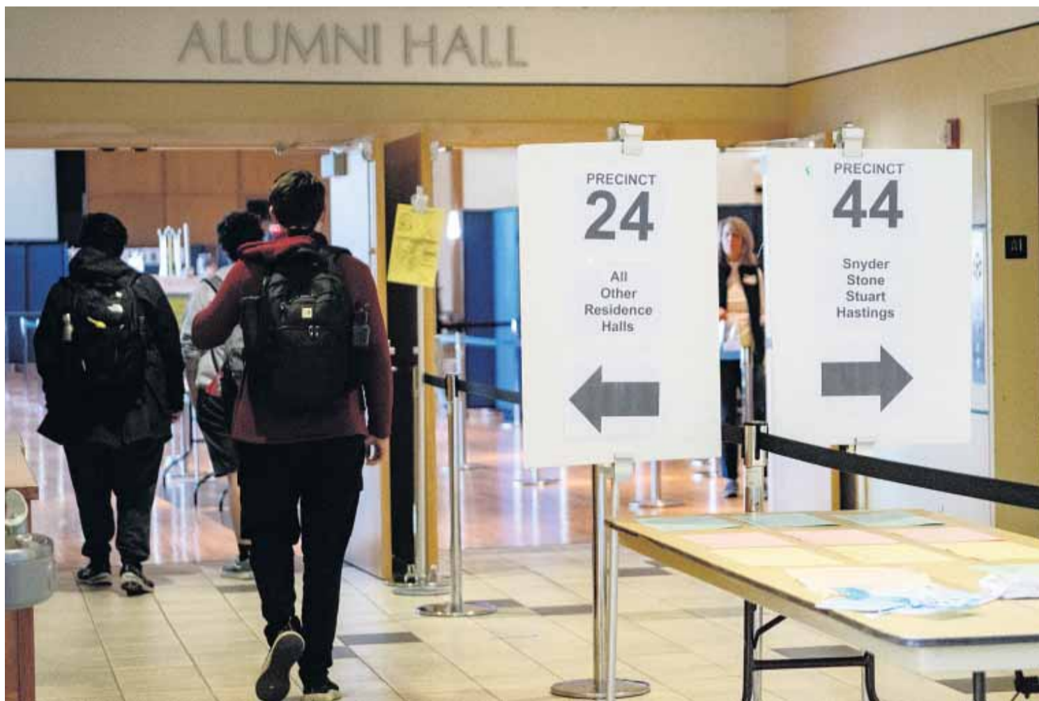
Penn State students enter Alumni Hall in the HUB-Robeson Center to vote on Tuesday, Nov. 8, 2022.